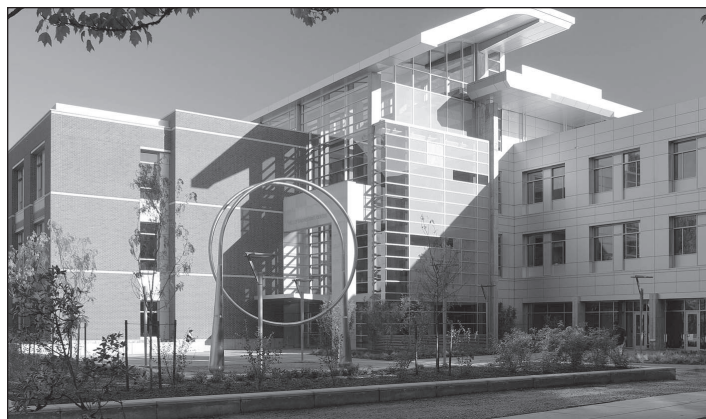
Kelley Engineering Center